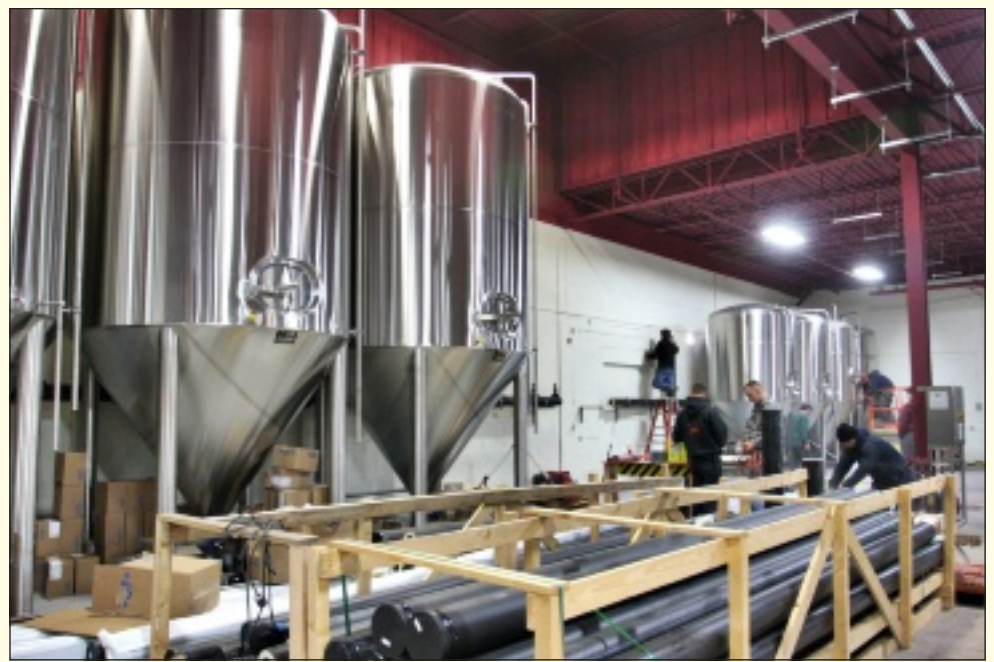
The Sly Fox Brewing Company in 2012 moved its operations to a much larger facility in the Circle of Progress in Pottstown. The $6 million project filled 30,000 square feet in the Circle of Progress and brought 20 full-time jobs to the borough.

Chester County side as a result of the new Route 422 bridge being built at the Sanatoga Interchange, thus creating a vital connection between Pottstown and the Chester County portion of the trail which comes up