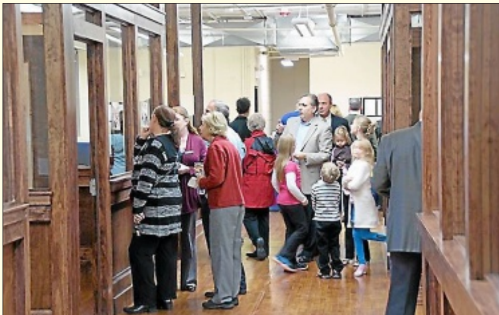
VideoRay recently held an open house at its new Pottstown headquarters. The company purchased the former Levitz building on High Street and renovated 32,000 square feet, to be filled by 32 new full-time jobs.

Follow Evan Brandt on Twitter @PottstownNews