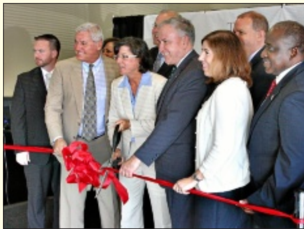
At left, the ceremonial ribbon cutting for the grand opening of the MCCC University Center in Pottstown is shown. In 2012, the college expanded into the former AAA building on South Hanover Street for its University Center project, which makes four-year and graduate degrees available at the Pottstown Campus.