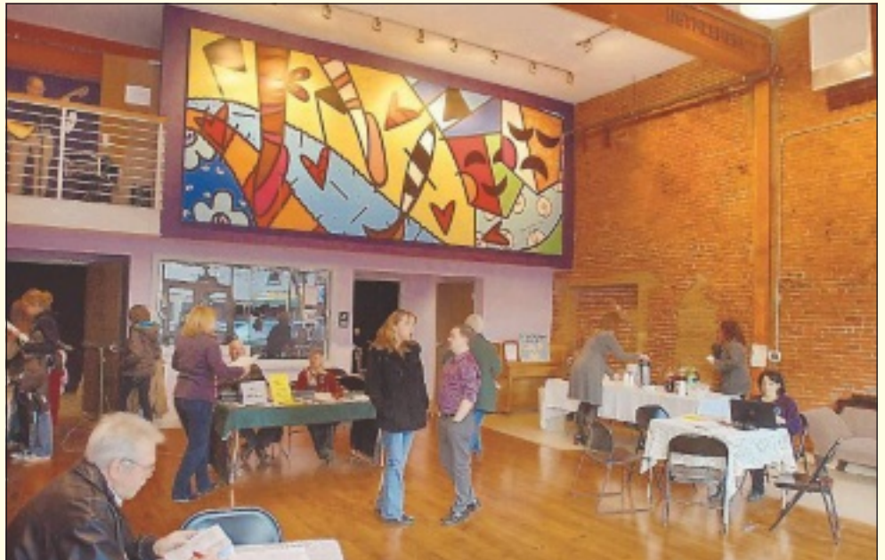
Visitors check out the lobby and box office area of the Steel River Playhouse in Pottstown. Once known as the Tri-County Performing Arts Center, the nonprofit theater and classroom center not only changed its name, but completed the second phase of renovations to its High Street location. In 2012, it staged 90 performances.

• Schuylkill River National Heritage Area Headquarters – In addition to the expansion of the college into that building, the Heritage Area organization opened its River of Revolution interpretive center, something that will continue to attract visitors to Pottstown and to the Schuylkill River Trail, Bamford said. That trail will be extended from Pottstown back over to the